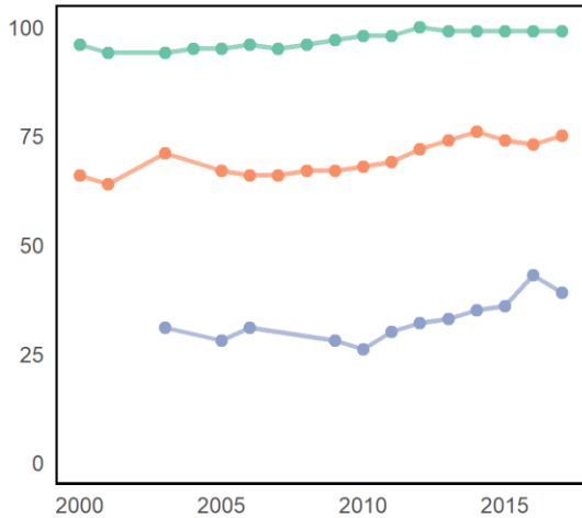
Adjusted net enrolment rate

● Primary ● Lower secondary ● Upper secondary