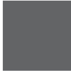
Pull quotes c0/m0/y0/k75