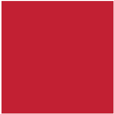
Primary color c16/m100/y86/k7