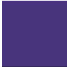
Secondary graph color c84/m92/y9/k14