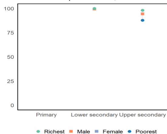
Completion rate, 2014